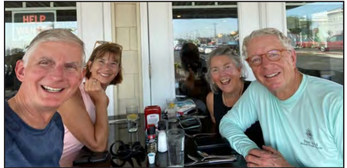
The Bolero crew at breakfast in Cape May following an all-nighter on the outside.