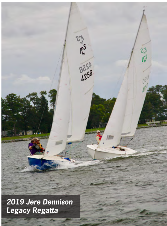
2019 Jere Dennison Legacy Regatta