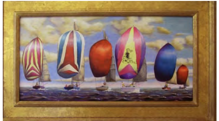
Lew Thatcher's oil painting Flying Spinnakers