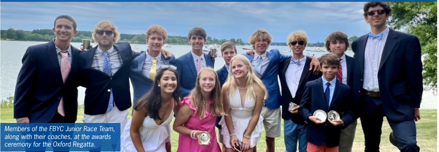
Members of the FBYC Junior Race Team, along with their coaches, at the awards ceremony for the Oxford Regatta.

Our Junior Race Team wrapped up an incredible summer season with five top three finishes at the Oxford Regatta, the final CBYRA High Points Regatta of the summer! The regatta was held August 13-14 at Tred Avon Yacht Club. But the entire final week of the season was amazing, with many of our junior sailors racing all week on the Bay, first at the Maryland State Championships on Tuesday and Wednesday at Rock Hall Yacht Club, followed by the Miles River Yacht Club Annual Junior Regatta on Thursday, and finally, the Oxford Regatta, held on Saturday and Sunday-all in one hectic week sailing in large and competitive fleets.