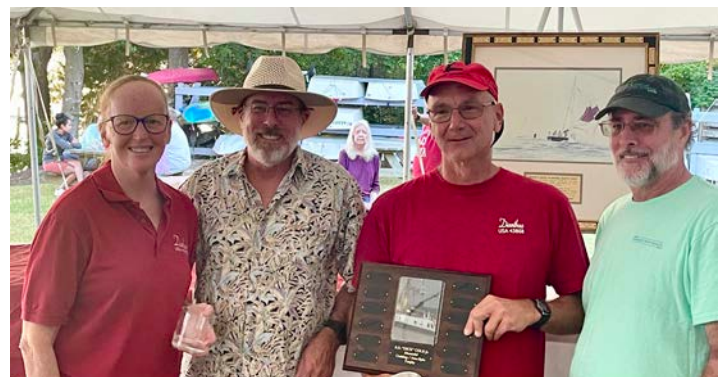
Dick Cole Award Winners - Dianthus

See everyone at Stingray Point Regatta 2024!