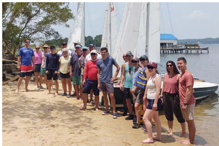
Sail Training Day Students and Instructor July 2023—Piankatank Beach