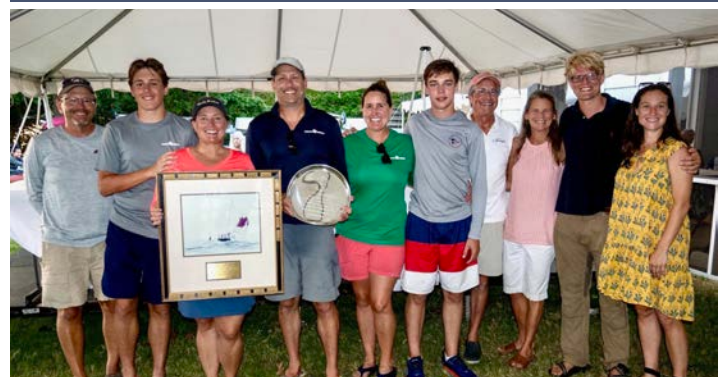
Halsey Award Winners Cheeky Monkey