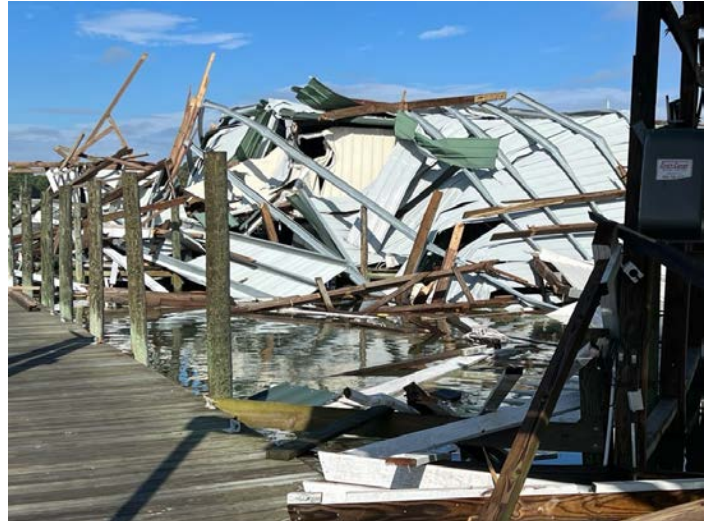
While our cruisers slept in Urbanna, a microburst at Regatta Point decimated a boat shed.