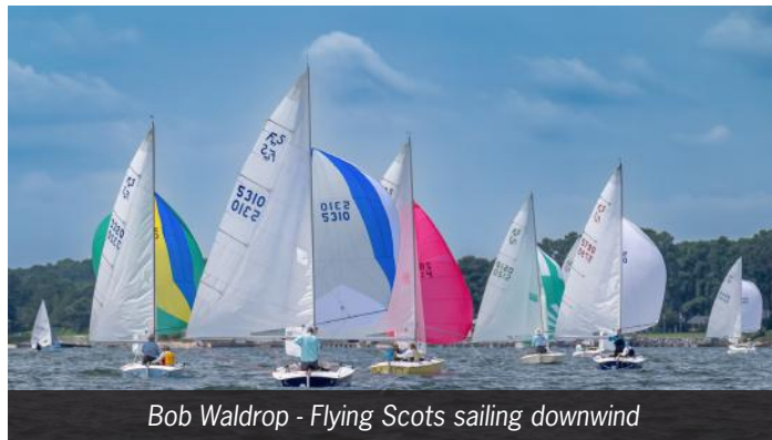
Flying Scots sailing downwind