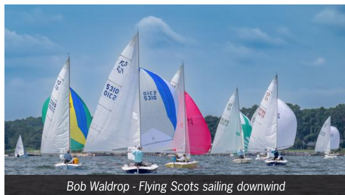
Flying Scots sailing downwind