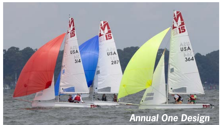
Annual One Design

We welcome volunteers for all these events to help them run smoothly and entertain everyone. Please notify contacts for volunteer opportunities!