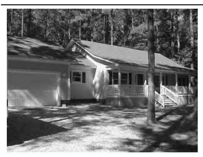
DELTAVILLE - New Construction with access to creek off Piankatank River! Spacious one story home, hardwood floors, Anderson windows, eat-in kitchen, dining room, fireplace with gas logs, 2 car garage, and many more quality features! $159,500