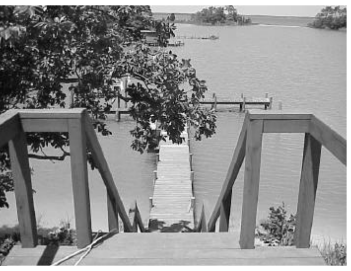
MEACHIM CREEK- 1.4 acre waterfront building lot w/325' waterfrontage and great view out to the Rappahannock River! Well and septic system installed, Pier w/Boatlift, and sand beach! Ready to build! $192,000

WILTON CREEK- Lovely wooded waterfront lot in quiet community setting. 151' waterfrontage, shared pier with approx. 5' MLW. Community amenities include clubhouse with pool, tennis, and exercise room w/ sauna. $124,500