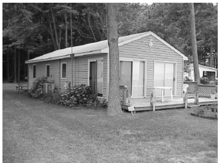
DELTAVILLE - Wide water view of Rappahannock River and deeded access to SAND BEACH! Central heat & A/C. Sundeck. 2 lots. $127,000

a fantastic view out Sturgeon Creek! PRICE REDUCED! $385,000