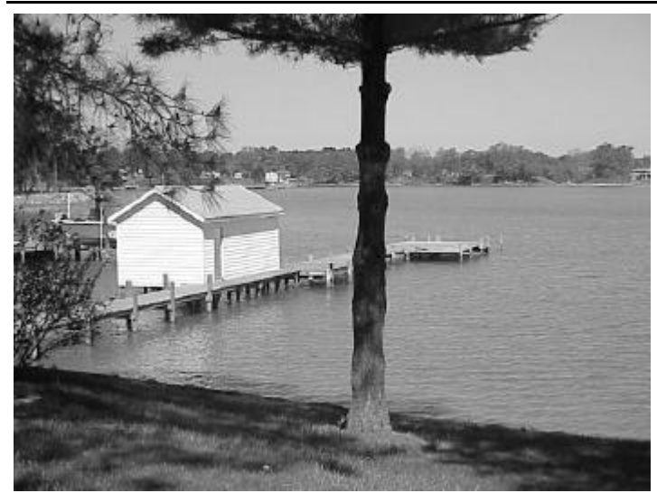
DELTAVILLE- 3 bedroom, 2 bath home w/private pier, boat house, pool, and beautiful mature landscaping that creates a park-like atmosphere! Attached garage w/elevator, basement/rec-room and an enclosed 2nd story porch with

a fantastic view out Sturgeon Creek! PRICE REDUCED! $385,000