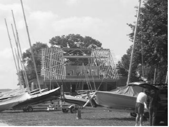
DELTAVILLE - Anther view of the new clubhouse as you enter the east entrance