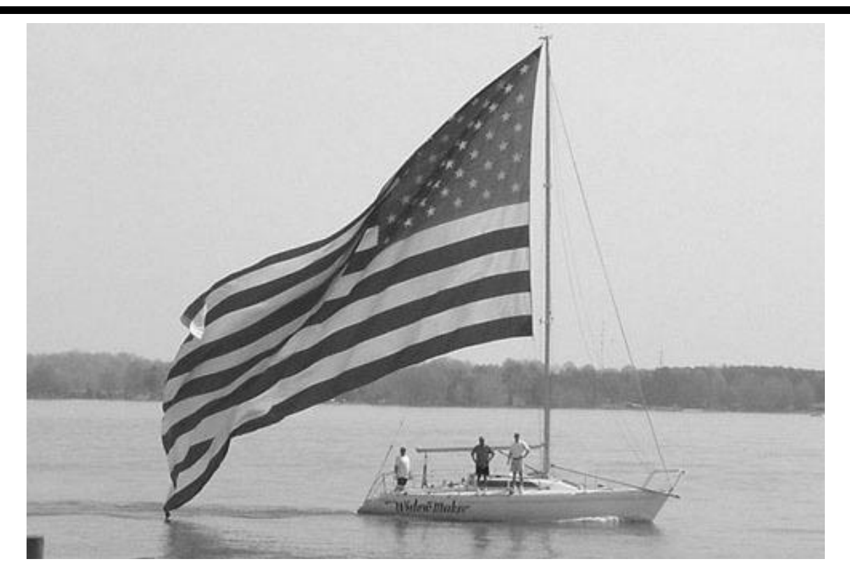
This was seen the weekend of September 15 on Lake Norman during the Peninsula Cup Regatta. The entire fleet (40+ boats and RC) cheered when this, er... sail? went up. It was a very uplifting moment.