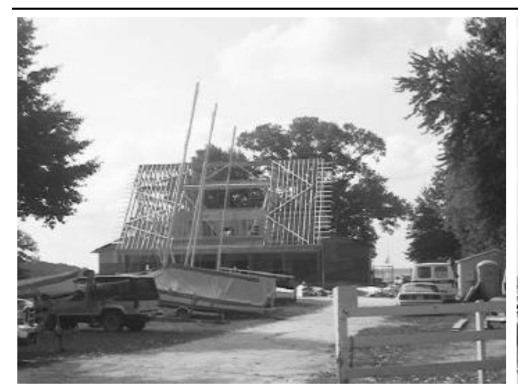
DELTAVILLE- The latest view as you approach the club on Fishing Bay Road.