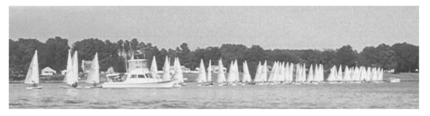
2000 U.S. Laser Masters Championship at FBYC