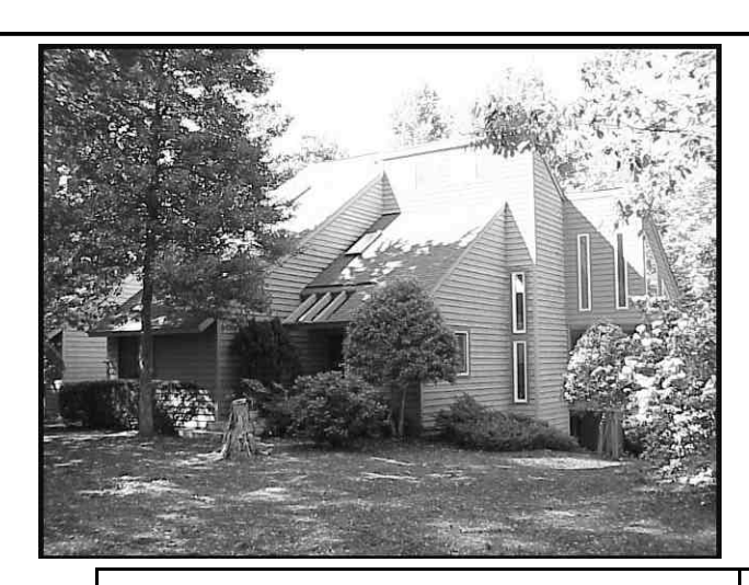
COVES AT WILTON CREEK-Spacious Contemporary Home featuring 4 bedrooms, 3 bathrooms, a large great room, a gourmet kitchen and screened porch. Multiple skylights and insulated windows throughout. 2 car garage, pier with deep water boat slip, and convenient access to community clubhouse, pool, tennis courts, and boat ramp. Offered at $510,000