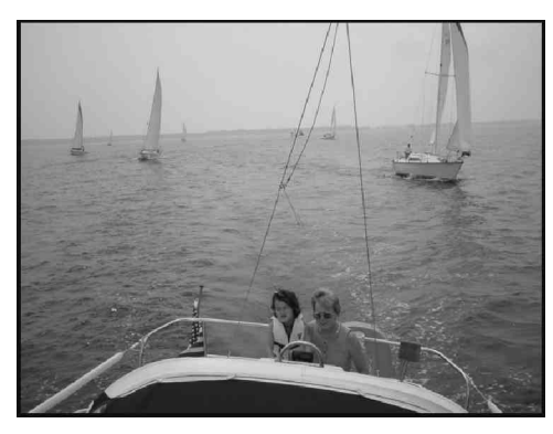
1st Annual Cruise with Kids

no excuse to leave your boat in the parking lot. Let's get them in the water and use them for their designed purpose.