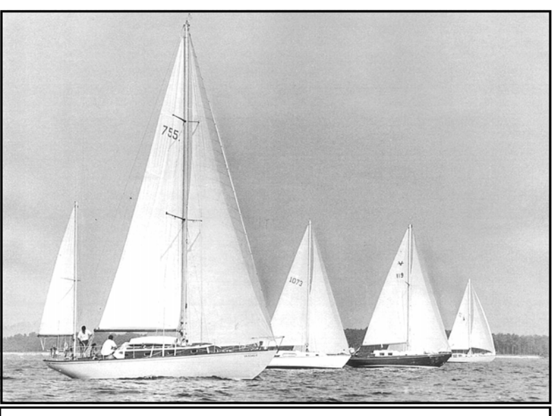
Allons (foreground) Starting in the 1965 Annual Regatta

Whether it is a jolly weekend on the Bay or an Atlantic crossing it takes a wee bit of planning. The rules in most ocean races specify enough food for the expected voyage plus two weeks. As usual, it is the fine point that gets you and this time it's that two weeks. Have you the