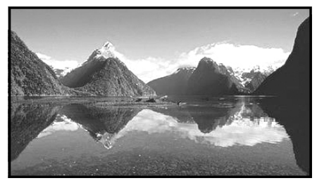
FBYC Group Headed To New Zealand

It was a great gathering and definitely worth the trip to Deltaville.