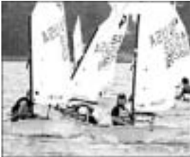
Junior Week Sailors

Our 2004 Junior week has come and gone, but what memories, and what satisfaction for the Junior Division Staff and their host of helpers. After two weekends of Opti Kids, and two Sundays of Team sailing, the five day Junior week started in glorious conditions. Maybe a little too much wind on the first two days for some of the parents, but it obviously didn't faze even the youngest sailors. And Fishing Bay was a wonderful sight, seemingly filled with Optis, 420's, Lasers, sailboards and Mobjacks, as always generously provided by club members. Others will write more about the week's activities, but it is always gratifying to see Juniors, parents, grandparents and in one case an uncle, learning to sail in what has to be one of the best locales anywhere.