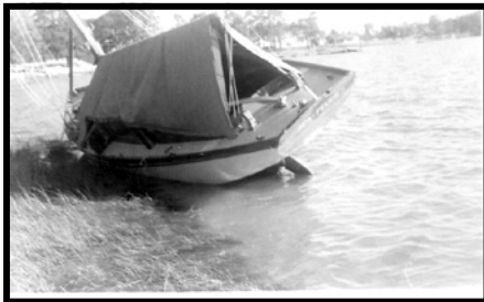
Sea Fever Beached 1954