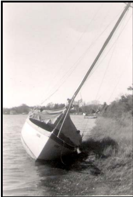
Beached Yacht 1954

There was one major difference between Hazel’s era and Isabel’s era. Back in the 1950s, some of the club yachts were on permanent moorings in Fishing Bay. Obviously, Fishing Bay could not offer the same protection as Jackson Creek and the moored boats were beached in the storm.☐