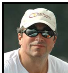
2006 FBYC Officers