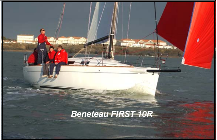
Beneteau FIRST 10R