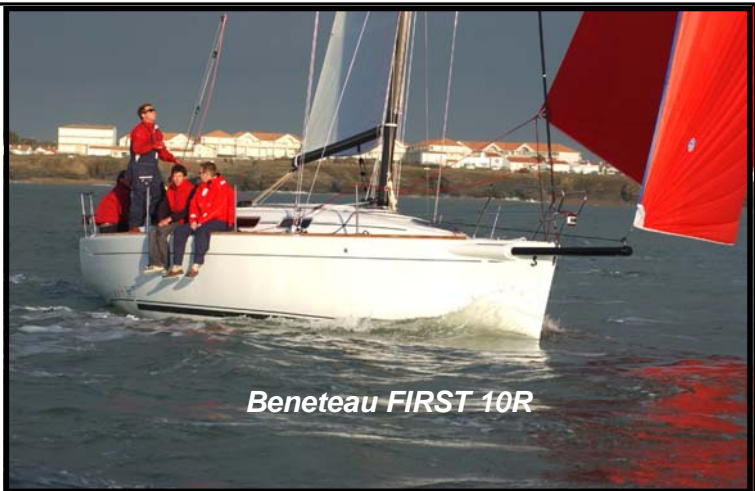
Beneteau FIRST 10R