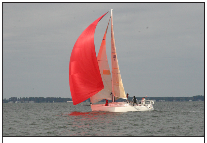
Double Eagle - winner of the Fall Series PHRFA