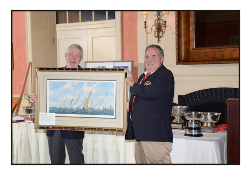
WINDWARD START TROPHY – awarded to the FBYC enrolled PHRF-B yacht with the best score in the Offshore Fall Series. Elancer