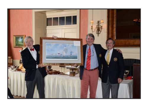
BARBER TROPHY – awarded to the PHRF-C skipper who beat the most competitors during the Regular Racing Season. The Prophet Syndicate