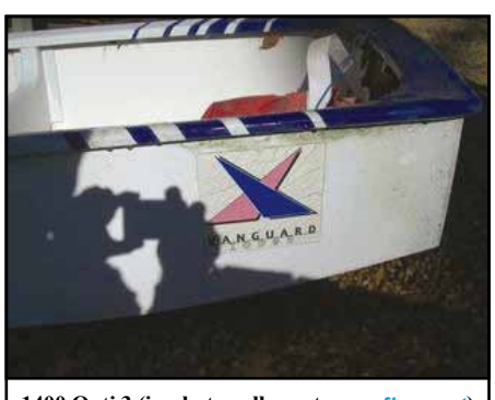
1400 Opti.3 (in photo gallery at www.fbyc.net)