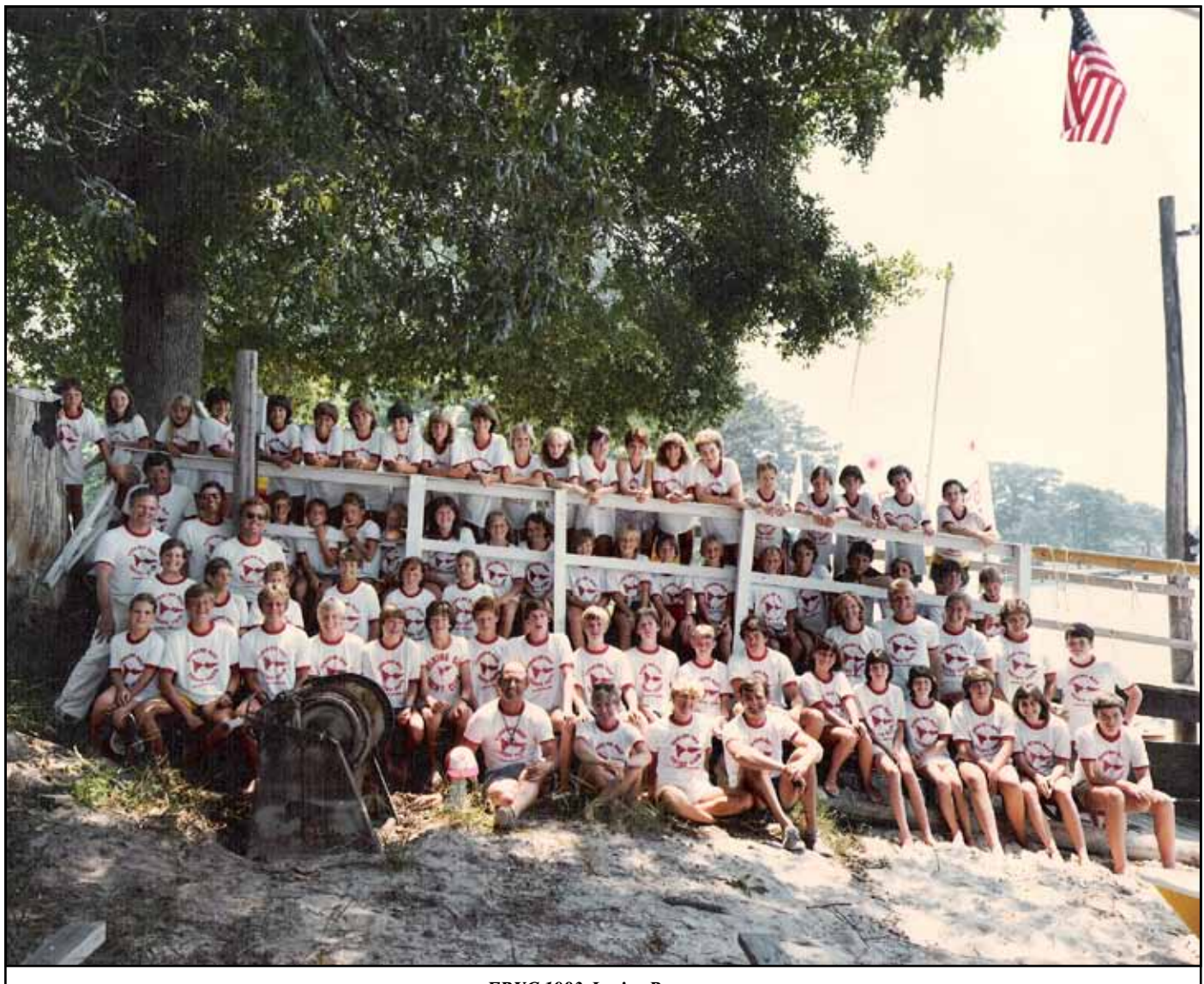
FBYC 1983 Junior Program

Although the Laser was deemed a success, still the Junior program sputtered along, spread over a few weekends throughout the summer and coached by a handful of parents with junior age offspring. The program was adequate but not a spectacular success.