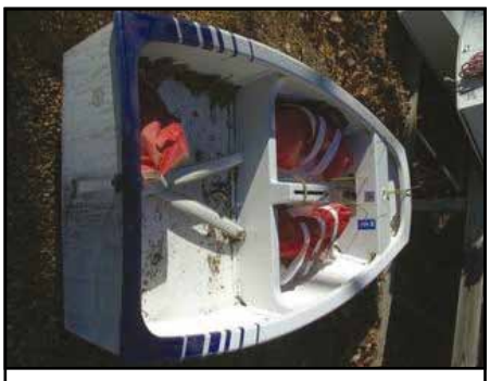
1400 Opti.2 (in photo gallery at www.fbyc.net)

UNIDENTIFIED OPTI: There is an Opti on the member racks that we have been unable to identify through enrollment forms. The Opti specifications are: Vanguard Performance hull built 7/25/2000, Hull #OQT08212G000, USA Sail #10336, International Opti #108212. FBYC sticker #1400 was incorrectly placed on this Opti. If this is your Opti or if you know the owner's name, please contact Mary Spencer at execsecy@fbyc.net.