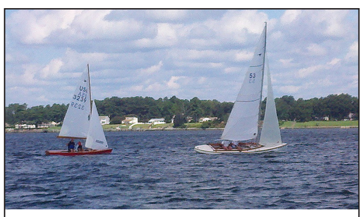
An exciting day of Classic Fleet racing on September 9, 2012.

Deltaville Maritime Museum PO Box 466 Deltaville, VA Please mark your donation "for rebuilding".