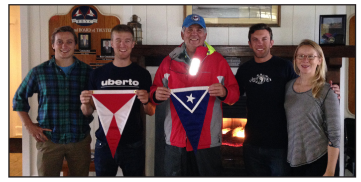
PHRF ADOPTS MAJOR CHANGES FOR 2015

At last month's PHRF Delegates Meeting major changes were adopted that will affect PHRF racing on the Bay. PLEASE SEE THE WEBSITE (www.fbyc.net) for a more complete writeup!