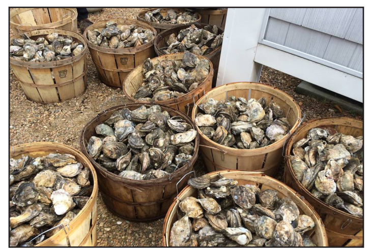
OYSTER PROJECT UPDATE: FBYC's silent new members: Oysters!

Thank you again for the great participation and leadership over the past year. I look forward to seeing everyone before or at the Oyster Roast! Register early and look for additional detailed information via the "Cruising" email list.