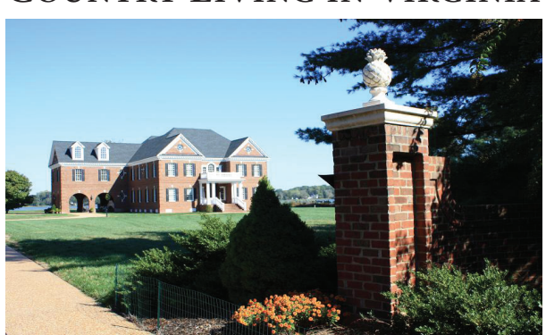
CRANEFIELD Offers Sought

Exquisitely designed 3-story brick home prominently situated on 4.76 acres at the end of a country lane with dramatic water views. 450' feet of frontage along the Ware River with approximately 5 feet MLW at the dock. Detached garage with guest quarters above.