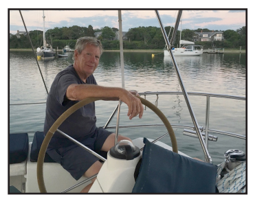
Enjoying a cool evening in