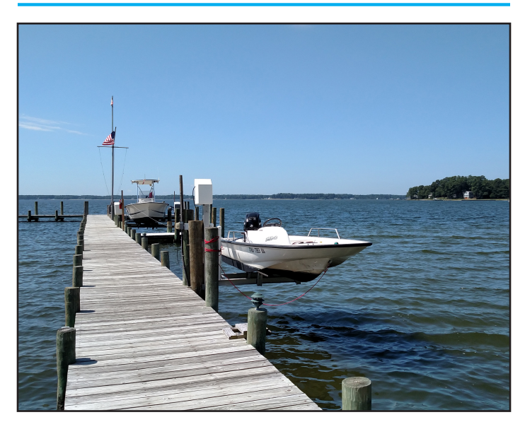
NEW BOAT LIFT

Permits have been approved and final contracting terms are under negotiation by the County and by Deltaville Boatyard, where spoil material will be off-loaded and trucked away. Expect work to begin in October and passage to remain open for at least one boat at a time while work proceeds.