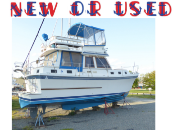
1986 Albin 34' $28,500