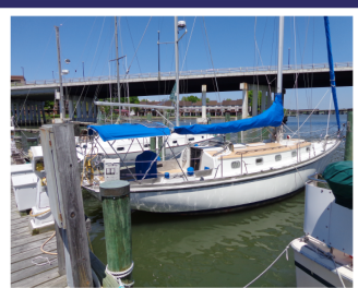
1978 Bristol 40' $35,500