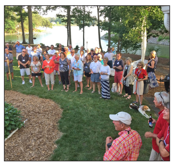
FBYC-OCC JUNE CHESAPEAKE CRUISE

On Sunday's return trip, the winds were lighter and most captains charted a course that included sailing and motor sailing.