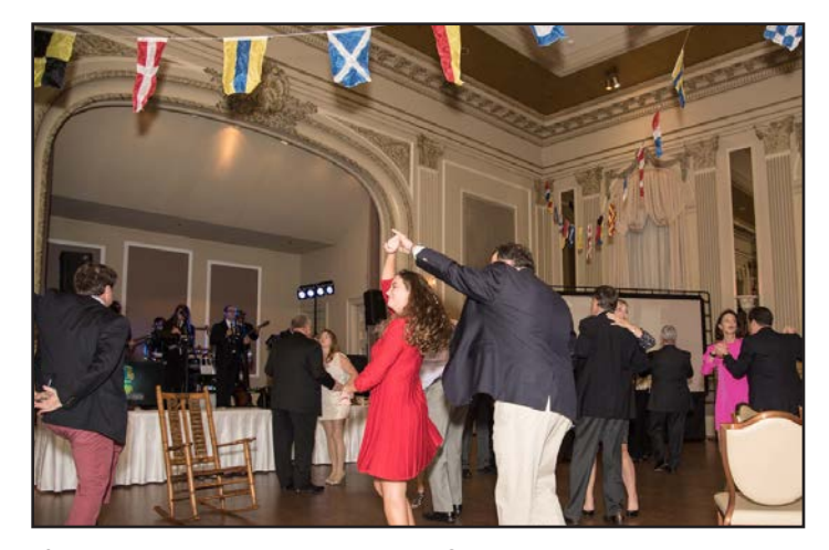
If you missed this year's Commodore's Ball, mark your calendar now for November 17, 2018, at the Commonwealth Club.

Following the ceremony, a Viennese dessert display was featured in the Solarium, with many of the Commonwealth Club's signature specialties. The gala evening was capped off with partygoers dancing the night away to popular tunes performed by the nine piece Alex Crain Band.