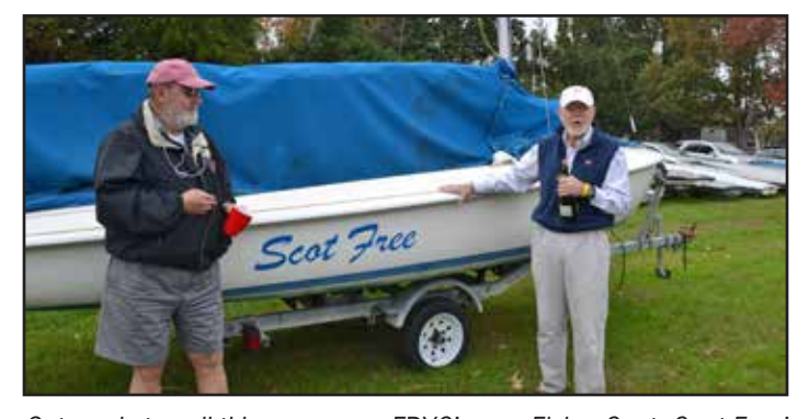
Get ready to sail this season on FBYC's own Flying Scot, Scot Free!

FBYC wants to help you get out on the water this season, even if you don't own your own boat. And we're making it easy. All you have to do is sign up on our website. To do so, click the SAILING tab, then click ADULT SAILING. Fill out the form and you're set. You can check-out our Flying Scot for unlimited use, for the ENTIRE sailing season—Opening Day to Closing Day—for only $100 per family. We want everyone to have equal access, so please review our full procedures and be sure to sign up in advance to reserve our Scot.