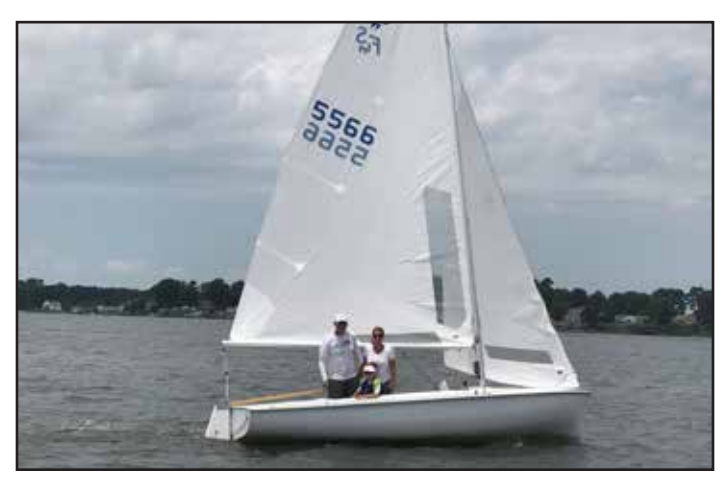
We Made It!

It has been another long, dark, and cold winter, but the days are getting longer and warmer. While some have had a chance to escape to the south over the winter, most of us have been anxiously awaiting Opening Day at Fishing Bay.