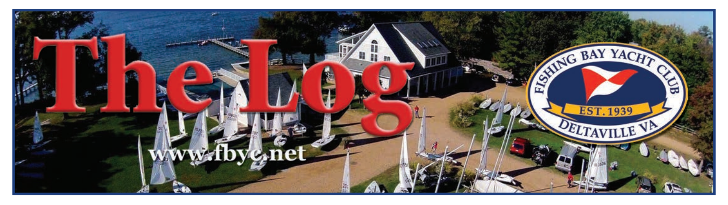
FROM THE QUARTERDECK