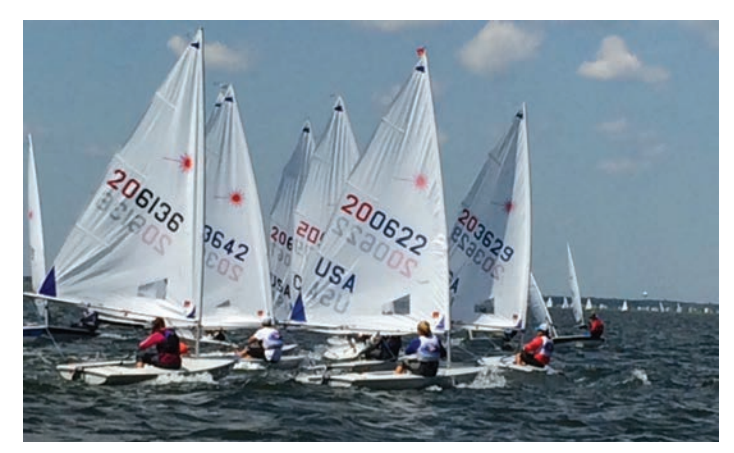
RACE TEAMS OVERVIEW

We are extremely excited to continue with our tradition of world class coaches. FBYC will once again have some of the best junior coaching staff on the East Coast. In addition, we will be welcoming back several of our Junior Race Team Alumni as assistant coaches.