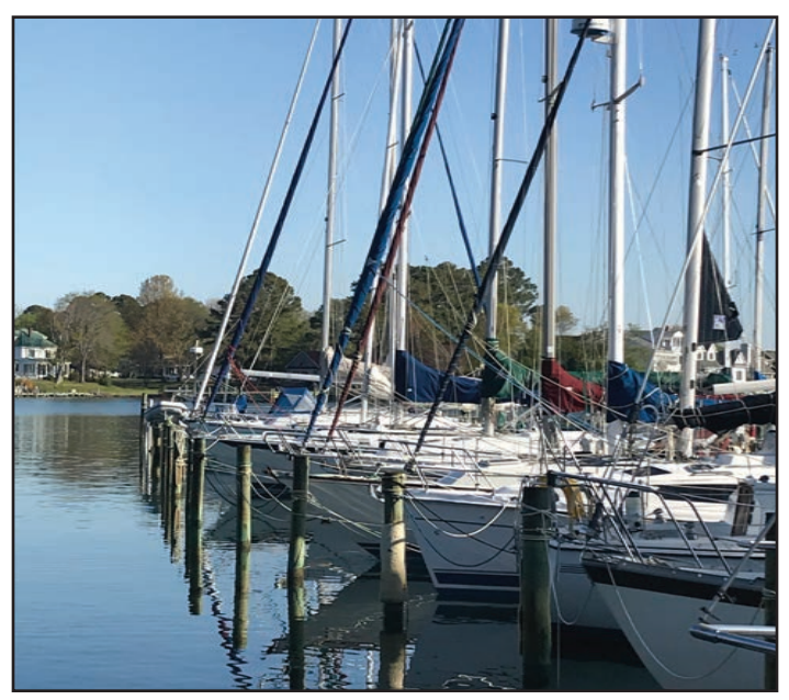
FBYC IS BEST OF THE BAY!

The honors just keep coming for Fishing Bay Yacht Club! Our Club was recently named by Cheaspeake Bay Magazine as one of the Best Learn to Sail and Best Advanced Sailing programs in Virginia! Thank you to all of our staff and volunteers who make the FBYC programs so amazing! Check out the full list of winners online at <a href="https://www.chesapeakebaymagazine.com/features/2018/bobboating">https://www.chesapeakebaymagazine.com/features/2018/bobboating</a>.