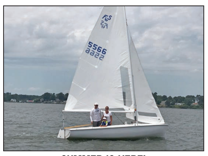
SUMMER IS HERE!

Summer is now in full swing and the Club is certainly a hive of activity! Our Open House Regatta over Memorial Day Weekend was another great success, even though we were unable to complete the sunflower raft-up. Thanks to Bev Crump for being the master of the raft-up and once again to Team Cahill and their volunteers for putting on a great party!