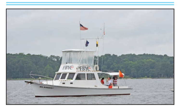
JOIN THE RACE COMMITTEE TEAM

Our Club's racing program depends on the group of volunteers who serve on the race committee teams. Have you thought about joining our team? We would love to have you, and welcome you to come out and learn one of the specialized jobs.