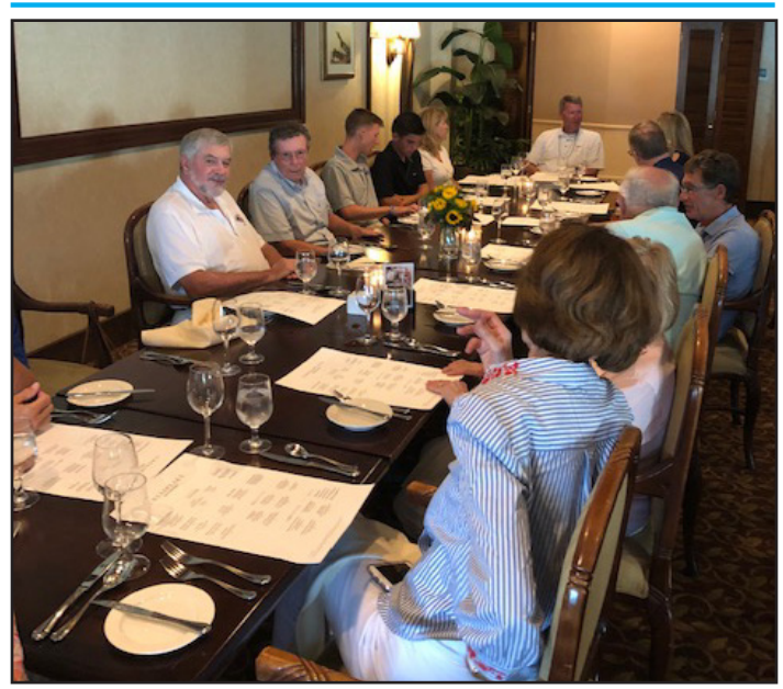
CRUISING TO THE TIDES INN

We will provide an introductory sail to familiarize new Club boat users with the Club Flying Scots, and to verify that the user has the skills necessary to safely use the boats.