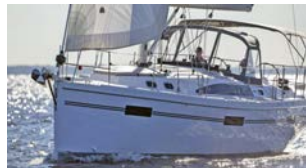
NEW! 2020 Catalina 425 On location Now