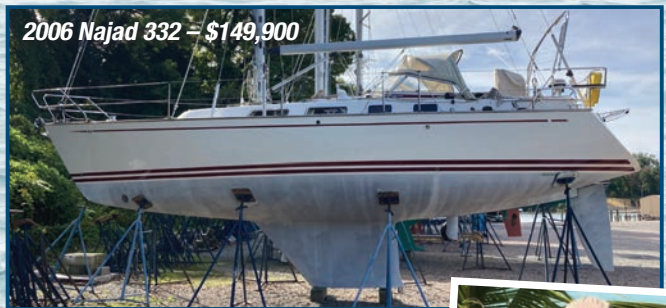
2006 Najad 332 – $149,900