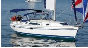
NEW! 2019 Catalina 355 HOT DEAL!