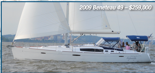
2009 Beneteau 49 – $259,000