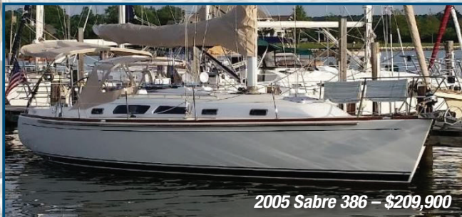
2005 Sabre 386 – $209,900