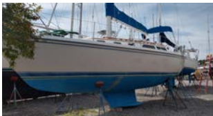
1987 Catalina 34' $29,995