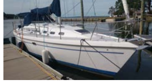
2001 Catalina 38' $97,900