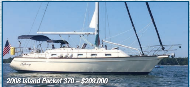
2008 Island Packet 370 – $209,000