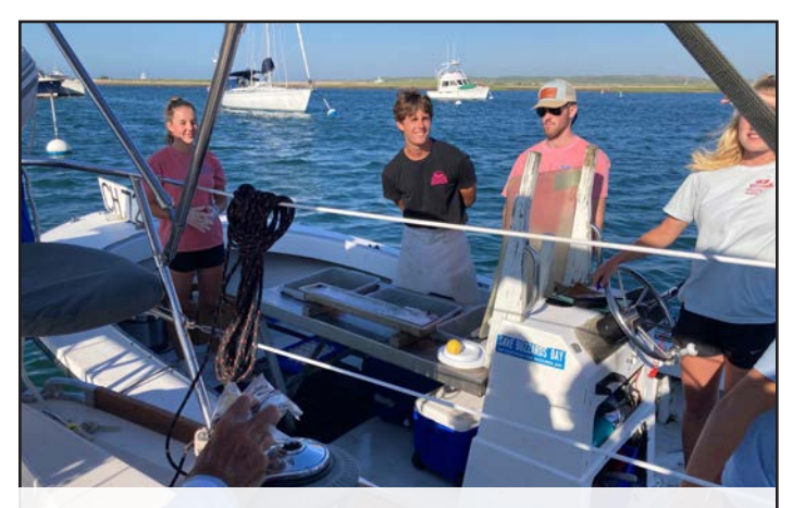
Young chefs bring hot food and chilled, shucked oysters to Reveille's cockpit at Cuttyhunk, MA.