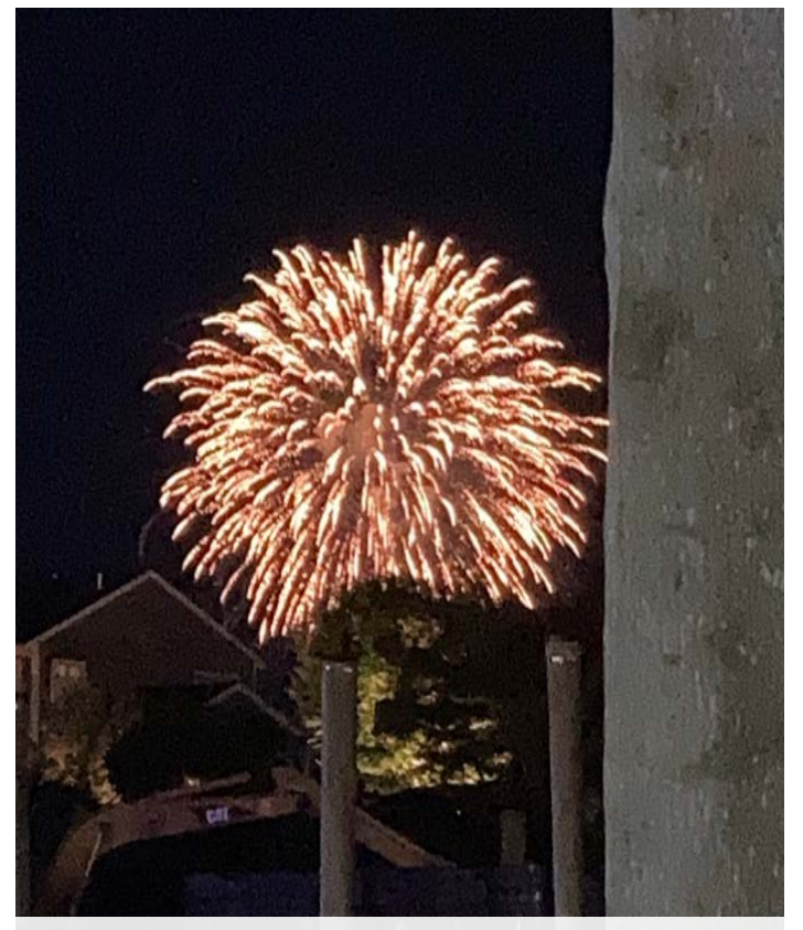
July 4th fireworks over Hyannis harbor.