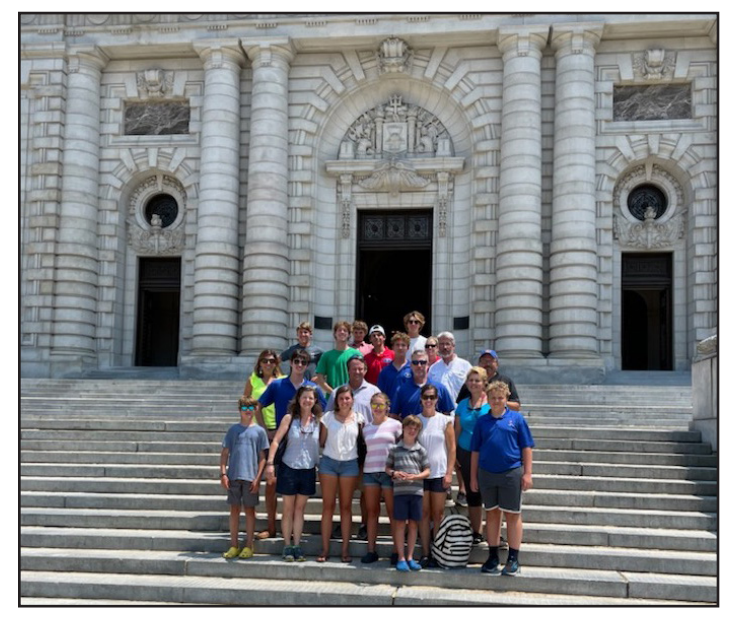
A group of junior sailors and parents attended a tour of the United States Naval Academy in Annapolis, MD on July 5. FBYC's junior race teams competed in the junior regattas at Annapolis Yacht Club and Severn Sailing Association on July 6-7.