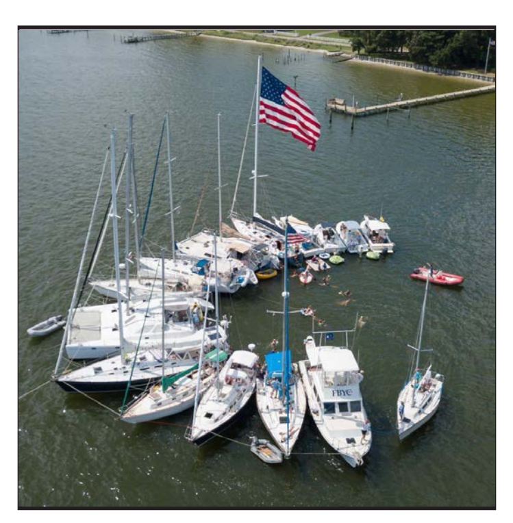
July 4th FBYC sunflower raft up

Motion made to replace motor in Rib 1 to support the Junior Program. Motion made and approved.