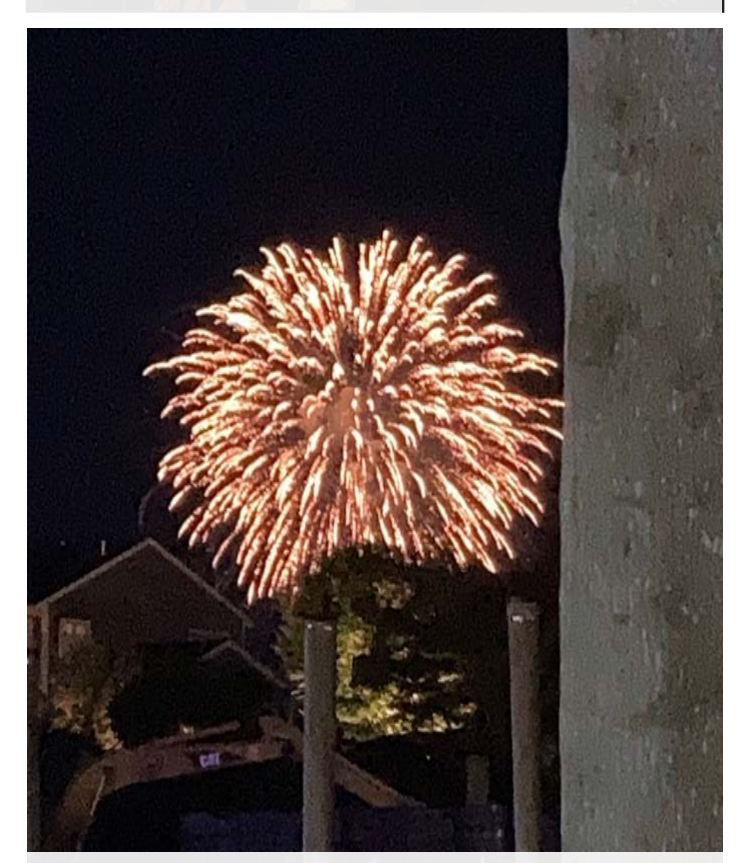
July 4th fireworks over Hyannis harbor.