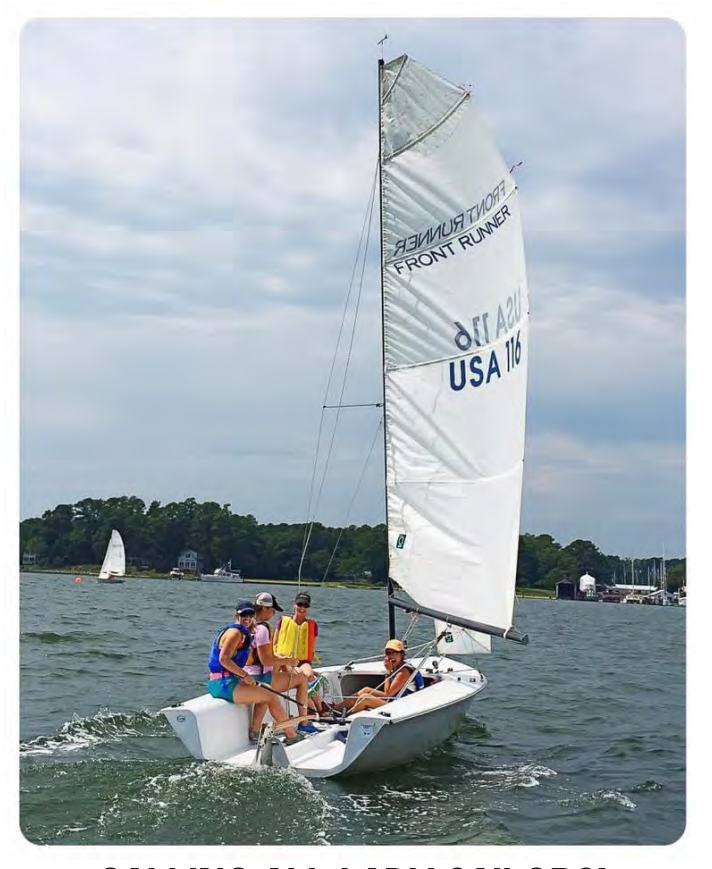
CALLING ALL LADY SAILORS! WOMEN'S SAILING CLINIC JULY 31 - AUGUST 1

WHO: Back by popular demand - for FBYC female members and non-members alike!