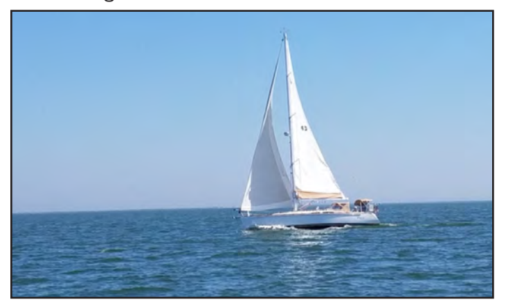
Whisper, part of the largest Sabre 426 fleet on the planet, was on the cruise, along with Reveille and Tender Mercies. We could enlarge the fleet if Nanug would join us.