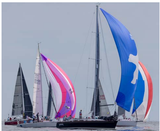
A big THANK YOU to these sponsors for the 27th Annual Stingray Point Regatta!