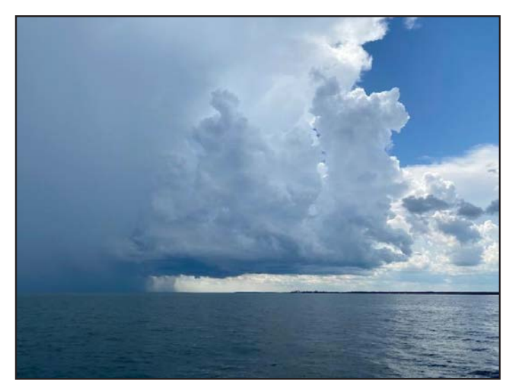
Sunday Thunderhead. Ditchley Cruise

Traveller II – engine problems. Attended by car.