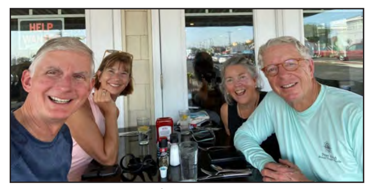
The Bolero crew at breakfast in Cape May following an all-nighter on the outside.