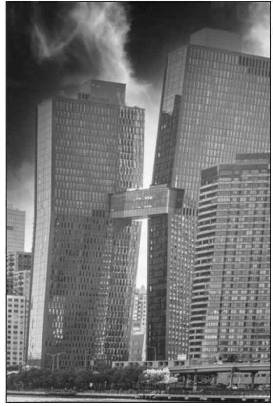
East River architecture: Iconic or Ironic?

In total, five boats visited 48 different ports ! That is certainly more than we could have visited - or should have visited - if we had stayed entirely together. Whether this will be a new template for the Cruising Division is yet to be determined. But for a long, complex trip, all would agree that it was fulfilling, enlightening, and FUN! And as Scott Sirles has observed, cruise participants traded July in Virginia weather for the much cooler New England weather: a good trade!