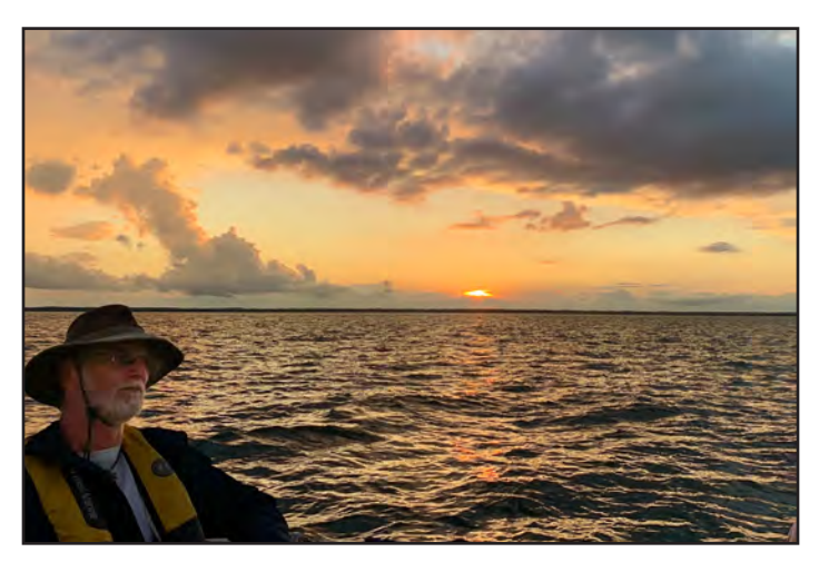
SMITH POINT RACE

The Long Distance Offshore Race to Smith Point on Saturday, August 21 had lots of everything. Except Wind.