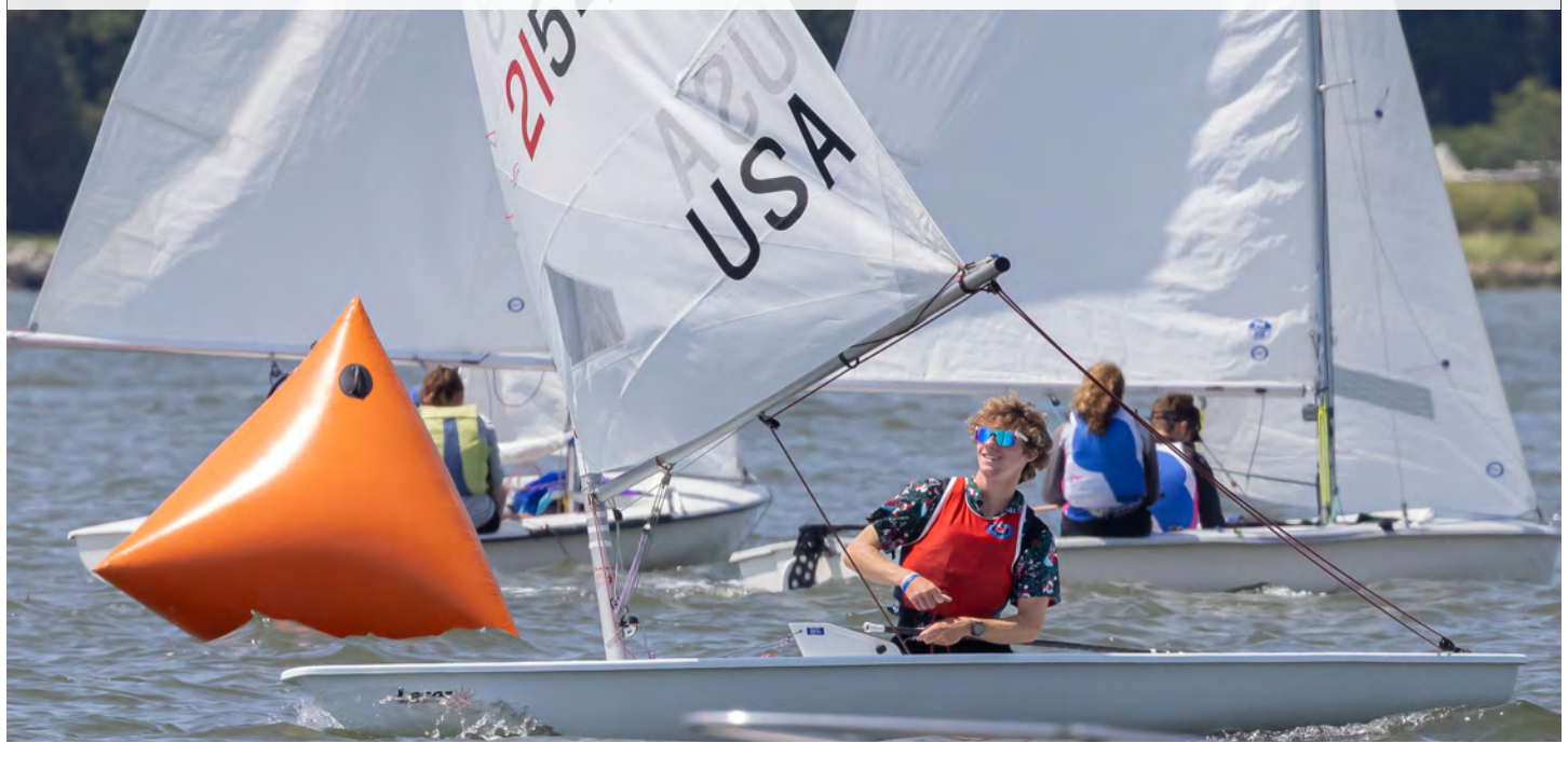
Sign your junior sailors up now for a great event! Early registrations will help us with planning: https://www.fbyc.net/events/2022/220625-junior-junior-regatta/

Please volunteer to help at the regatta: https://www.signupgenius.com/go/5080c4fa5aa2ba4ff2-20222