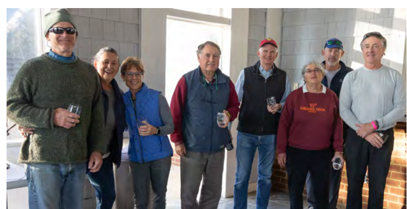
SPRING, FALL, and DISTANCE SERIES WINNERS