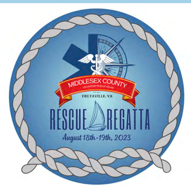
1<sup>ST</sup> ANNUAL RESCUE REGATTA Friday, August 18 – Saturday, August 19, 2023

Join us for a fun filled weekend of sailboat racing, fund raising, dinners and music, all to support the Middlesex County Volunteer Rescue Squad . Be a part of the inaugural Rescue Regatta by raising a sail and some dollars for this very important cause.