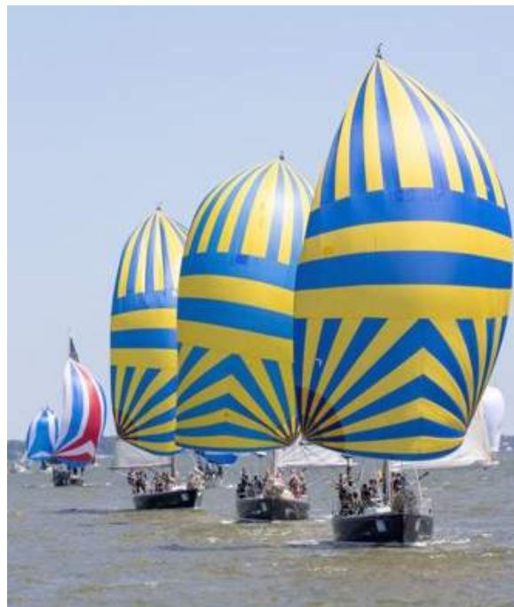
Navy 1, 2 and 3

hosted by HYC members in their houses. Being in close contact with them at the starts, I had no fear about them doing something stupid as their respect for the sailing rules and boat handling was superb. ~ Mayo Tabb