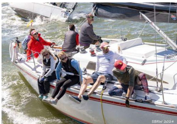
Excitation at a close start of A2

FBYC was well represented with 8 competitors; Nanuq – A0, Afterthought – A1, Excitation and Osprey – A2, Goin' – B, Cheeky Monkey and Schiehallion – C and Last Boat III – Phrf Cruising.