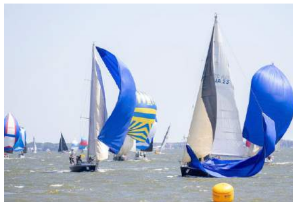
Spinnaker takedown on lead Navy boat

Finishing in the money were Afterthought -3 rd A2, Goin' – 2 nd B, Cheeky Monkey 1 st and Schiehallion 3 rd in C, and Last Boat III – 2 nd in PHRF Cruising.