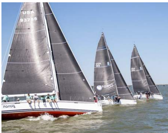
Nanuq started with the Melges 32.

In the second week of June, 80 Offshore racers competed in The Southern Bay Race Week/PHRF Southern Bay Championship hosted by Hampton Yacht Club. We had three days of racing in ideal winds. The first day was 10-15 knots then 5-10 knots the second and 10 knots for the last day. This is the first of the trilogy of PHRF Championships and big offshore regattas in the Southern Bay. Next is Screwpile July 19-21 followed by our own Stingray Regatta over Labor Day. If you have not entered Screwpile, do so soon, as it is a great regatta too.