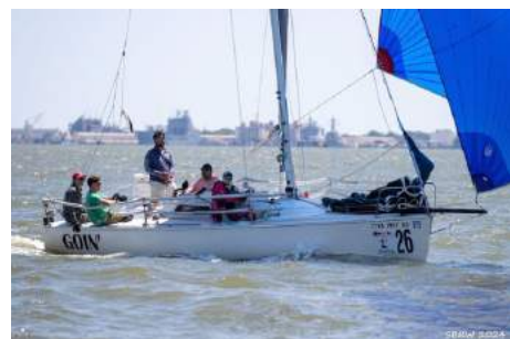
Goin' going downwind