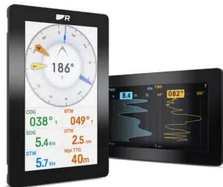
Raymarine Alpha Display