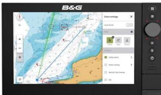
B&G Zeus SR