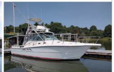
2005 Rampage 38' $265,000