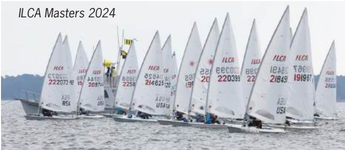
ILCA Masters 2024