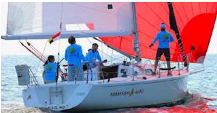
Kobayashi Maru sailing to victory in the Triple Crown Charity Series.