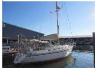
2004 Caliber 40' $220,000