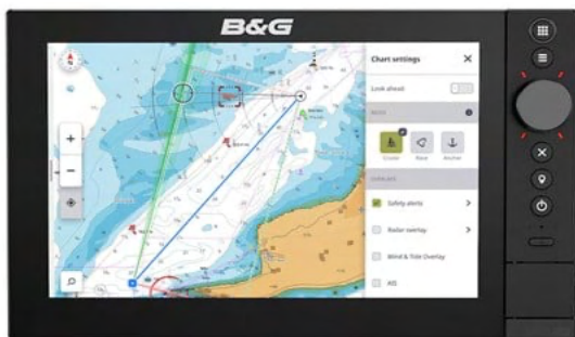
B&G Zeus SR