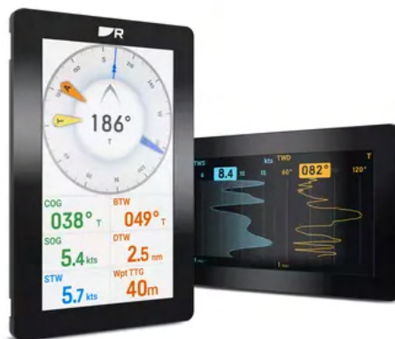
Raymarine Alpha Display