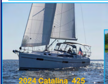
2024 Catalina 425