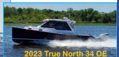
2023 True North 34 OE