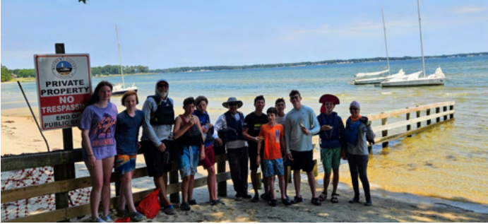
Junior Week Cruising Class at Godfrey Bay Beach, 2 nautical miles from FBYC