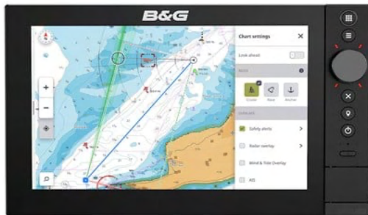
B&G Zeus SR