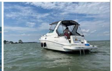
2003 Cruiser Yachts 28' $34,950