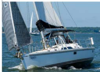
1997 Hylas 46'