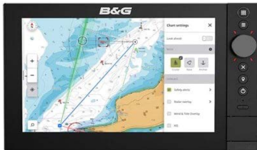
B&amp;G Zeus SR