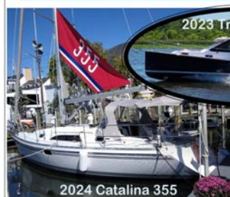
2024 Catalina 355