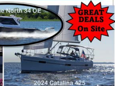
2024 Catalina 425