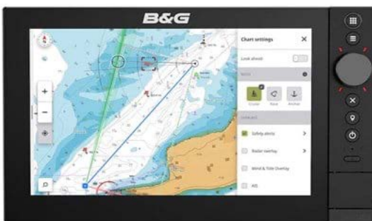
B&G Zeus SR