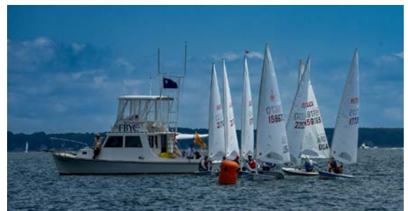
Summer Seabreeze Regatta ILCA start, photo courtesy of Bob Waldrop