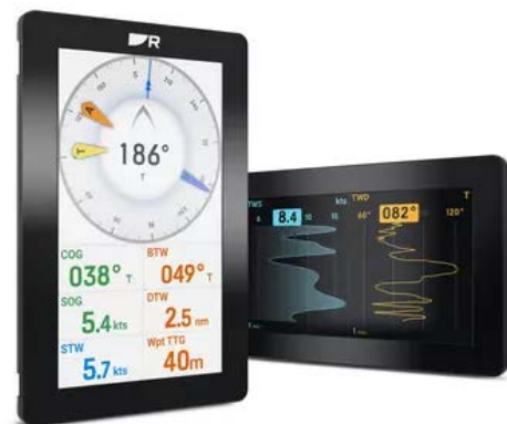
Raymarine Alpha Display