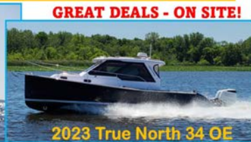
2023 True North 34 OE

IT'S NOT PERSONAL, IT'S BUSINESS. WE GET IT.