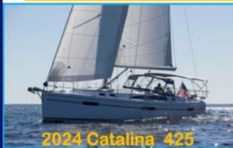
2024 Catalina 425